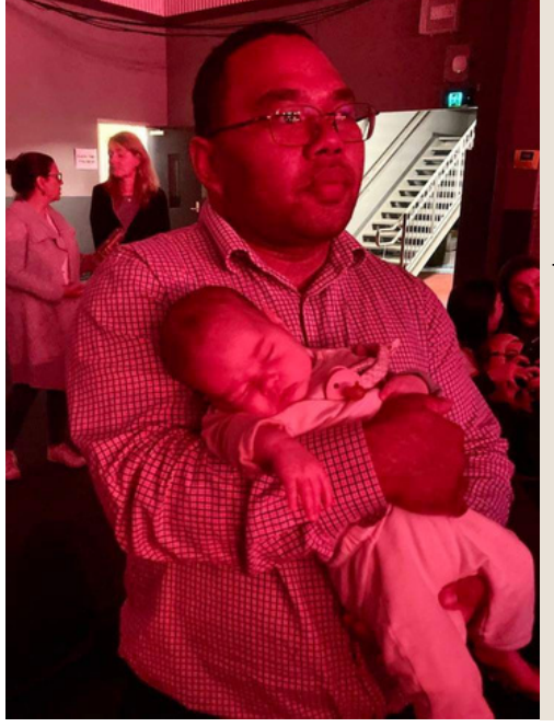
Ignite Conference 2023 in Sydney finished up last week and it was an fantastic event! Looking forward to 2024 already.