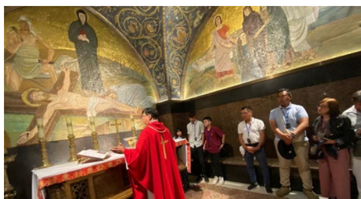
Our pilgrims travelling the Holy Land celebrated Mass in the Church of the Holy Sepulchre, and have shared what a priveleged experience it was - here they laid your prayers that you shared through the online form.