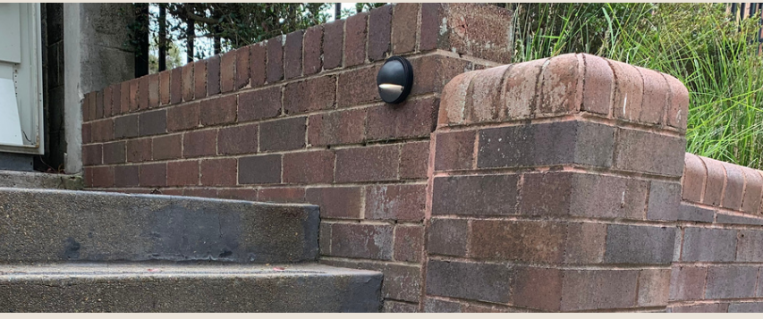
We've been slowly continuing to work on the Kirk St carpark - the newest addition are these lights on the stairs to help safely guide you to and from the carpark.